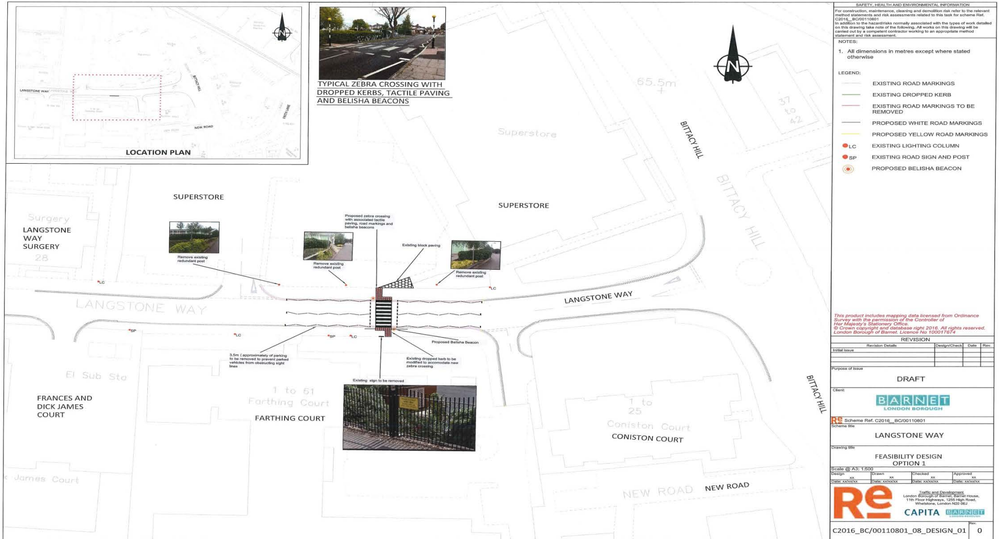
Option 1: C2016 BC/00110801 08-DESIGN-01